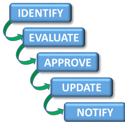
Figure 2 Architecture Maintenance Process

This section recommends a process for maintaining the Kansas City Regional ITS Architecture. The process described below and illustrated graphically in Figure 2 is based upon the more general discipline of Configuration Management. The figure illustrates a step-by-step description of how Architecture changes are identified, reviewed and implemented.